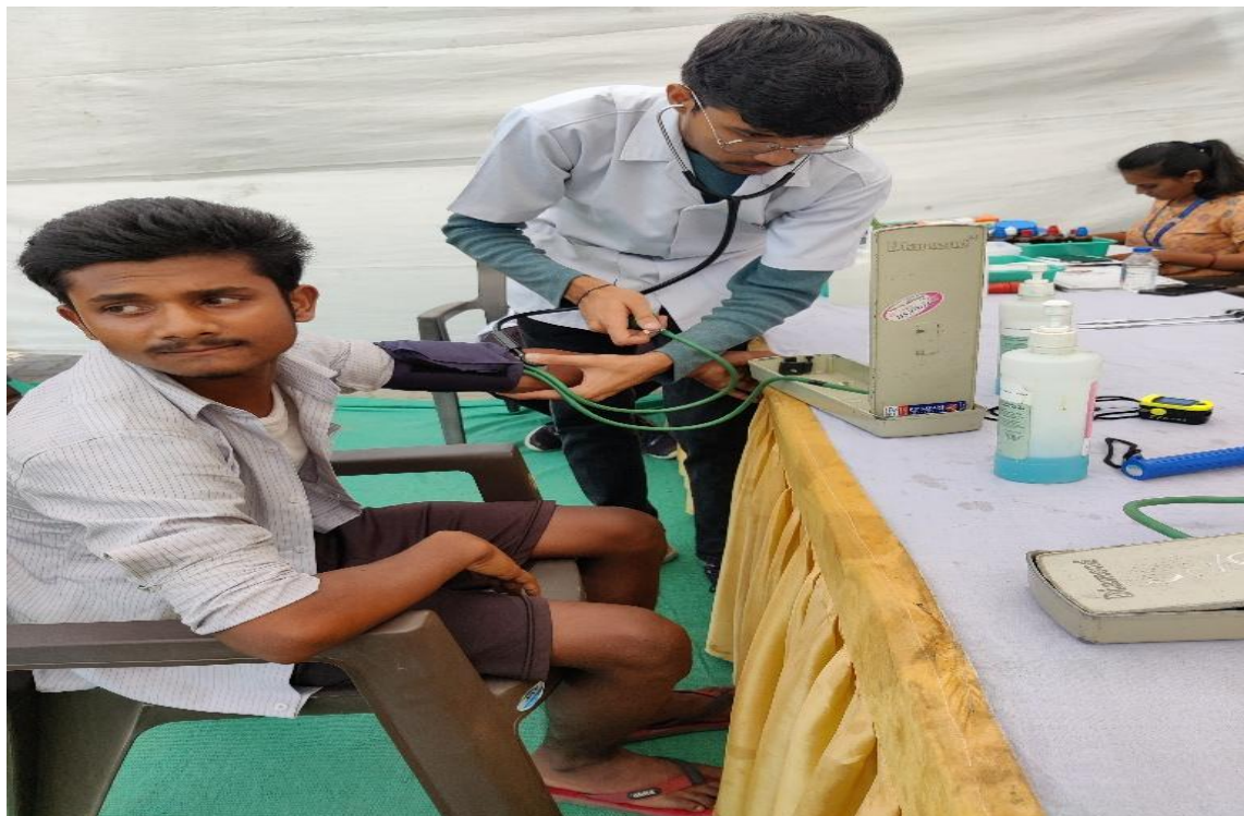
Photos of First aid training at village Asharma on September 17th 2018.