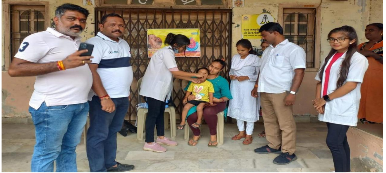
Photos of Volunteer going for a Polio Free India Drive on October 27, 2018.