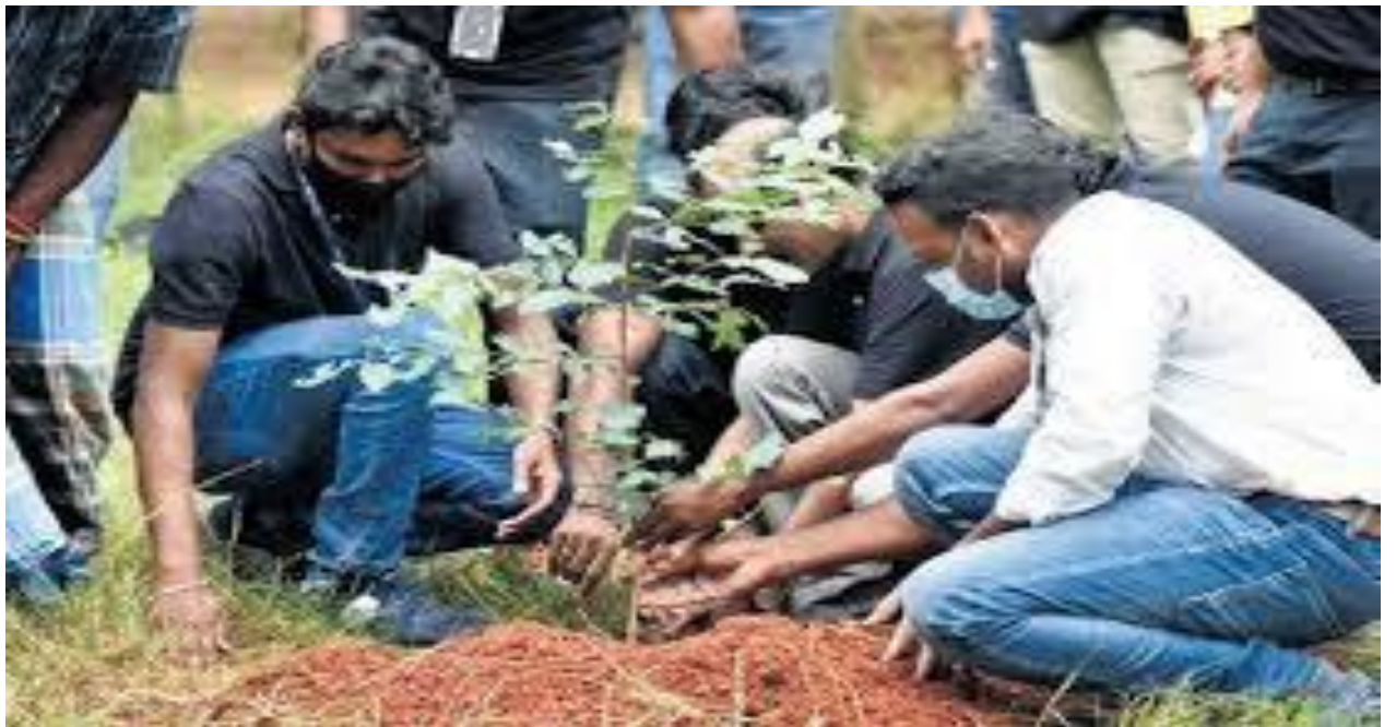
Photos of Volunteer going for Tree Plantation Drive at Government School, Bharan on 22/06/2018.