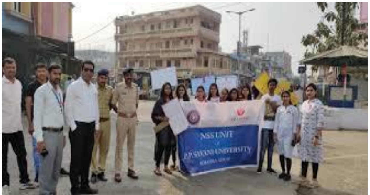
Photos of Volunteer going for Awareness Rally On Aids Prevention at Kosamba Market on 23/07/2018