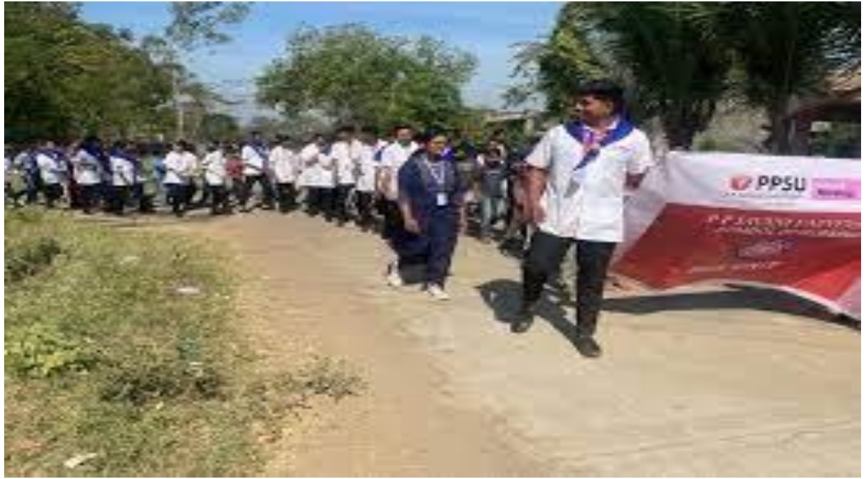
Photos of Volunteer going for Awareness Rally On Aids Prevention at Kosamba Market on 23/07/2018