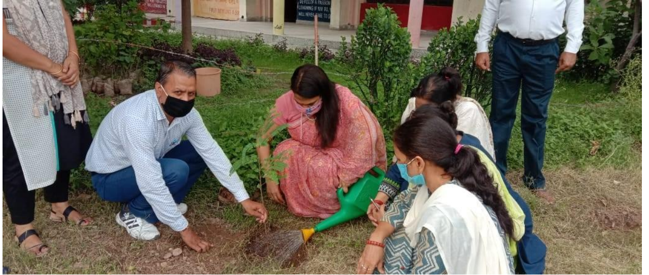
Photos of Volunteer going for Tree Plantation Drive at Government School, Bharan on 22/06/2018.