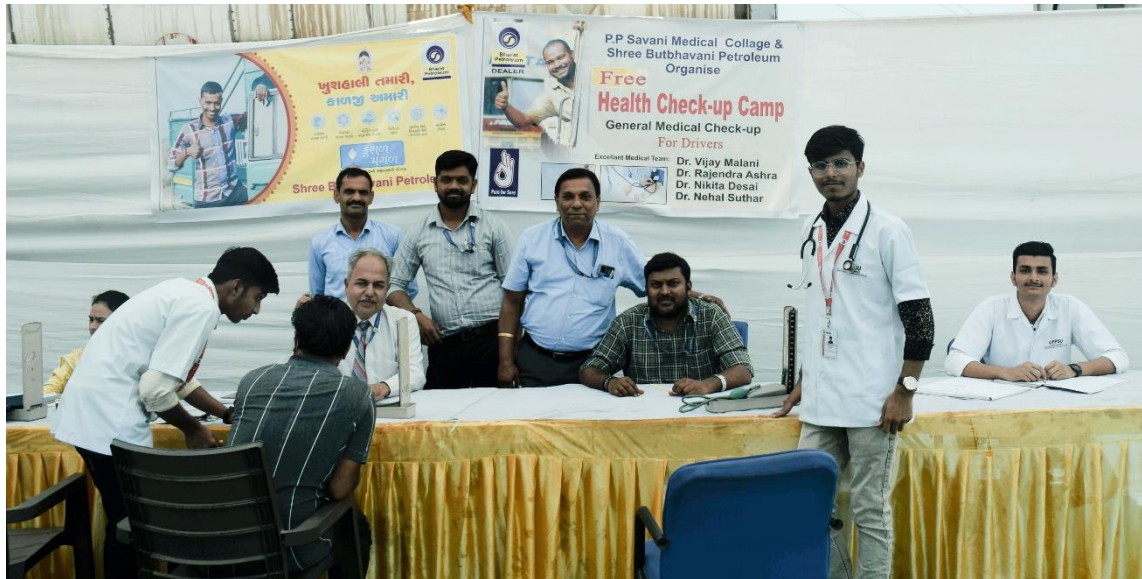
Photos of First aid training at village Asharma on September 17th 2018.