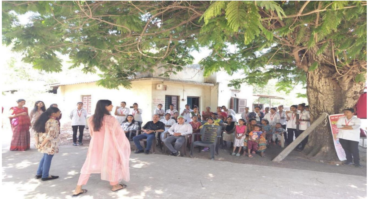
Photos of Volunteer going for No More Drugs Champing at Dhamdod on 22/11/2018.