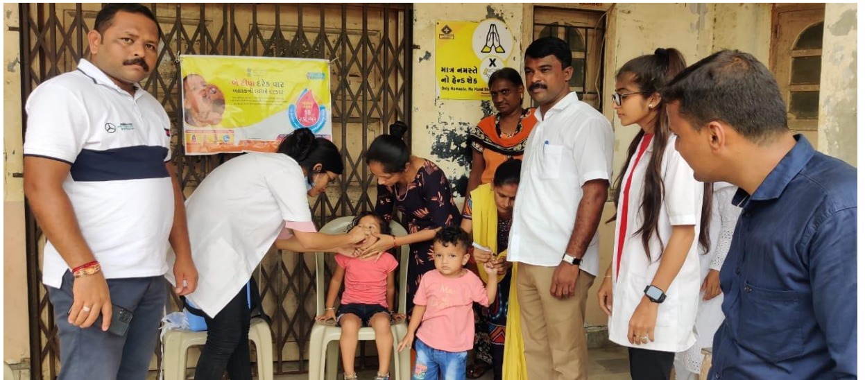
Photos of Volunteer going for a Polio Free India Drive on October 27, 2018.